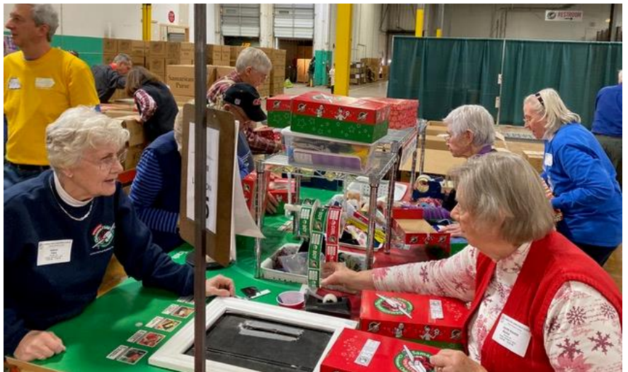
St. Luke volunteers at the Chicago Processing Center in 2019